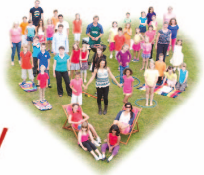
With thanks to Wickham Market Community Primary School